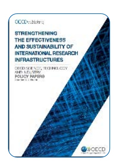
OECD expert group on sustainability April 2015