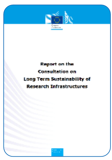
Stakeholder consultation on Long-term sustainability December 2015