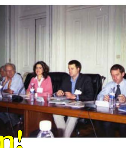
Thanks for your attention!